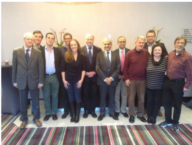
EBCOG Examination Standing Committee