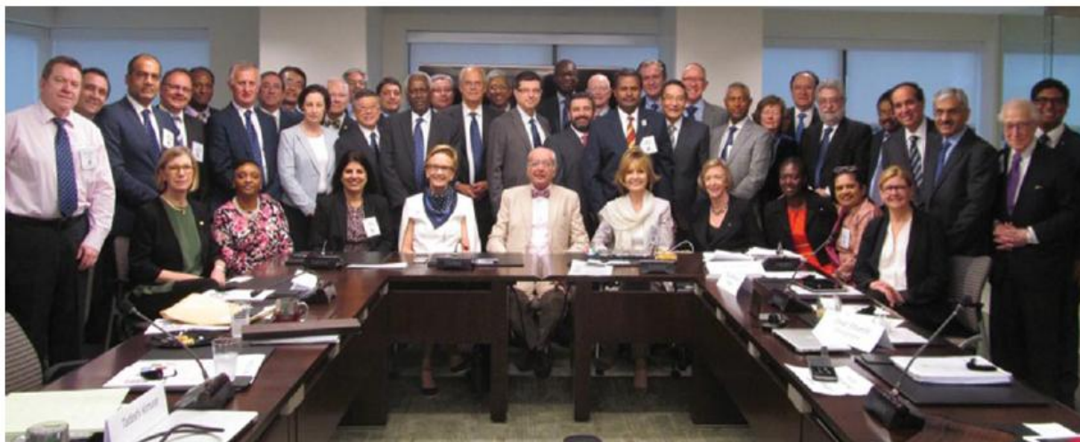
The FIGO Executive Board meeting in Washington, USA (May 2016)