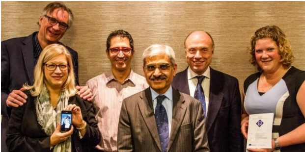
Members of the PACT Project Board

The final curriculum will also act as the basis of the EBCOG Examination and all the issues covered in the exam will be drawn from the curriculum. This will be an invaluable tool for all candidates. In addition, it will have a tremendous impact on how EBCOG conducts visits, and the hospital auditing process should also be able to monitor the implementation of this programme.