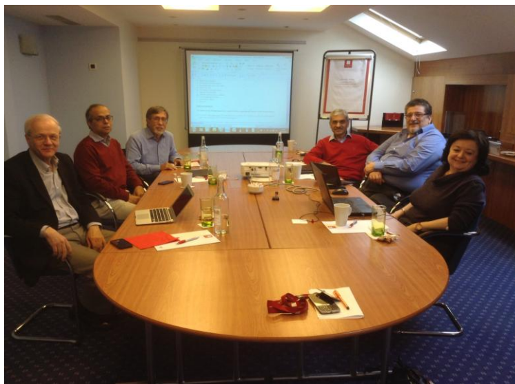
Exam QAC Committee Meeting, London February 2017