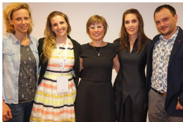
The ENTOG Executive Committee

ENTOG is represented on every EBCOG Standing Committee and Working Party and an ENTOG representative is always a member of the Visiting Team for specialist visits. ENTOG organises an annual Trainees' Meeting and Exchange Programme. ENTOG's held its annual